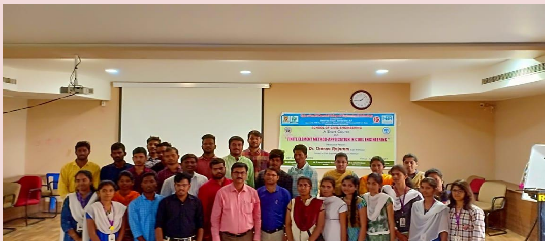
Short course on FEM